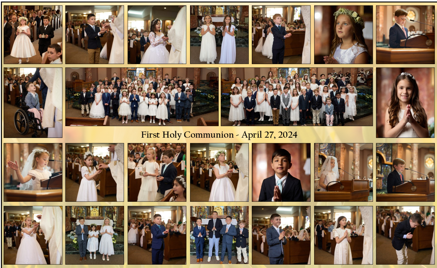
First Holy Communion - April 27, 2024

Please support our advertisers — they support us