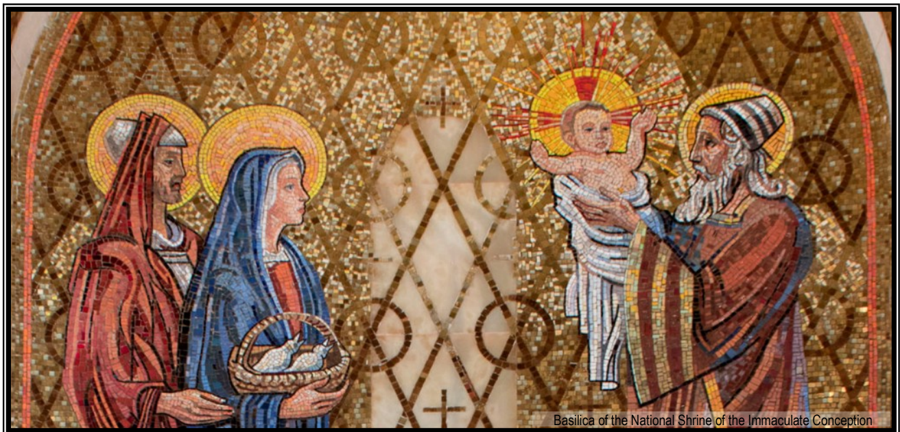
Basilica of the National Shrine of the Immaculate Conception

Today we celebrate the presentation of Jesus in the Temple and the purification of Mary.