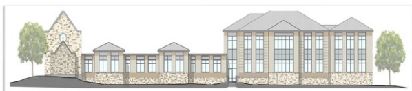
Faith and Education Center

This fall we will be welcoming our Religious Education and Confirmation Formation students back to campus!