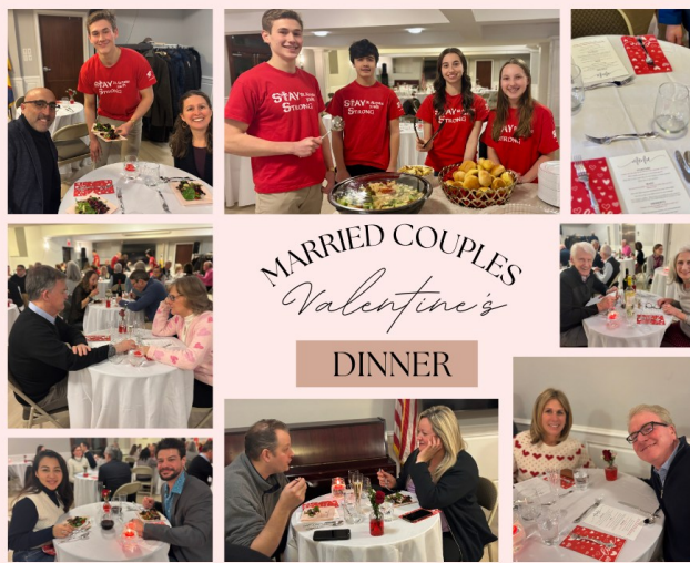
MARRIED COUPLES Valentine's DINNER