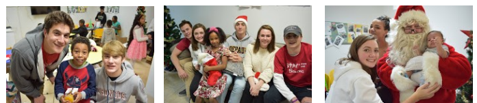
Our high school teens and Santa brought Christmas joy to the children at Thorpe at our Breakfast with Santa last weekend.

P.S. If you have not had the opportunity to join us, please pray on it ask God where He may be calling you in the new year! I will be praying for you too!