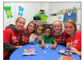
December was a month of many grace-filled moments. Our teens answered God's call and they were the face of Christ to so many of our brothers and sisters!