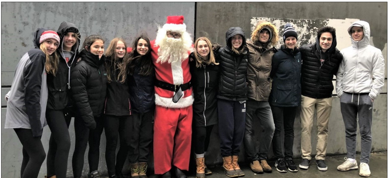
Our teens recently took to the streets of New York and distributed much needed clothing and food to the homeless. They even had a surprise visit from Santa!