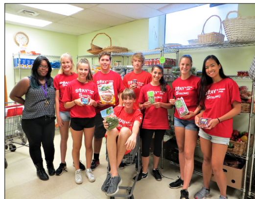
Teens kicked off our first Teen Bible Study of the summer and our first Summer Service Day!

Fan the Fire is back at St. Rose of Lima on Saturday, August 15th: Teens who are rising 8th graders to graduated seniors are invited to join the St. A's parish contingent for a fun, faith-filled day that includes Mass with the Bishop, Adoration, Praise & Worship Music and fun and games. Visit our sign up genius page for procedure to sign up.