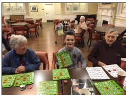
Some of our Confirmation students enjoyed playing Bingo with the BrightView residents as well as learning a little about each other. A good time was had by all!