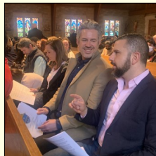
St. A's catechumen and candidates along with their sponsors at the Rite of Election and Call to Continuing Conversion.