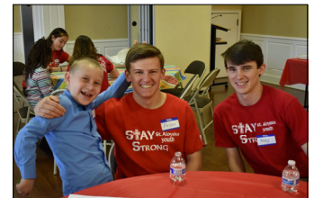
Our teens hosted the children of Breakthrough Options for an afternoon of Cinco de Mayo fun and fellowship which included making our own bottled "Spirit Salsa."