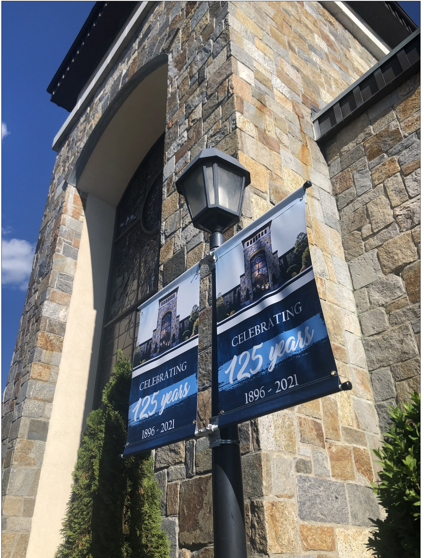
Saint Aloysius Parish and School use video surveillance cameras in and around the parish campus to maintain the safety and security of parishioners, students, staff and visitors. Cameras will not be permitted in areas where there is a reasonable expectation of privacy.