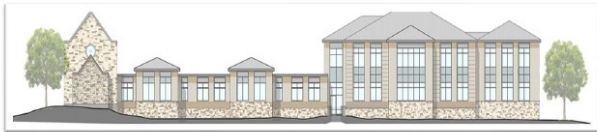
Faith and Education Center

This fall we will be welcoming our Religious Education and Confirmation Formation students back to campus!